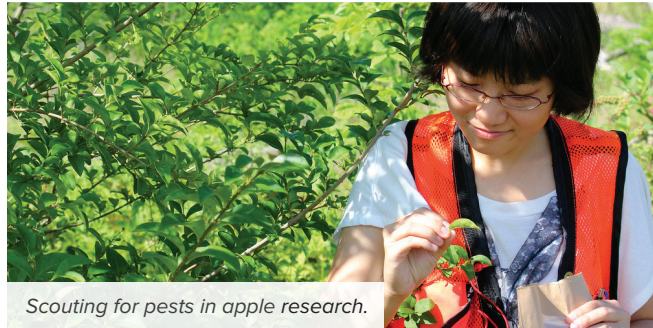
Scouting for pests in apple research.