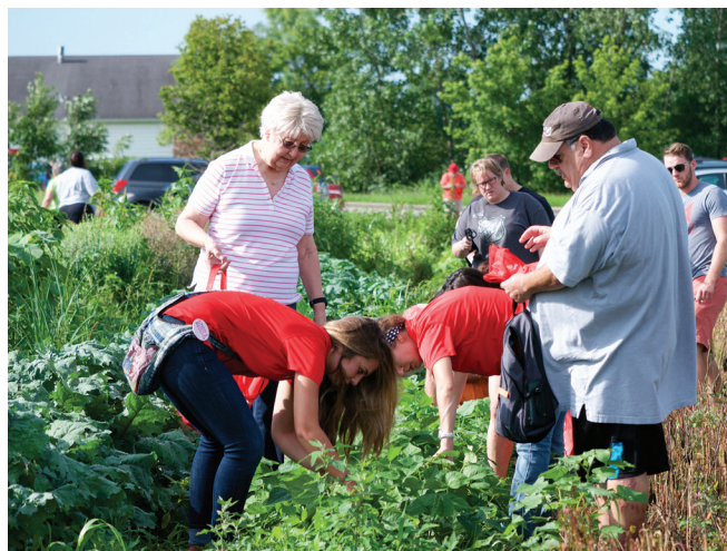
Garden of Hope participants harvesting fresh vegetables and learning about healthy cooking and eating.