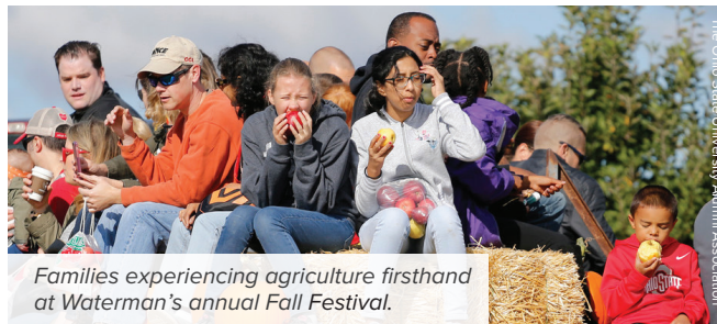
Families experiencing agriculture firsthand at Waterman's annual Fall Festival.